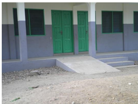
Housing Primary, Ho

VOICE GHANA conducted accessibility audit on 216 basic and second cycle schools structures out of a total of 340 basic and second cycle schools in the Ho Municipality between April and June 2011 to ascertain accessibility status of these structures for persons with disabilities (PWDs). This project was funded by STAR Ghana – (Strengthening Transparency, Accountability and Responsiveness in Ghana) ( www.star-ghana.org ). Analysis of responses from authorities of the schools surveyed indicated that 94.4% of the schools have no provision of