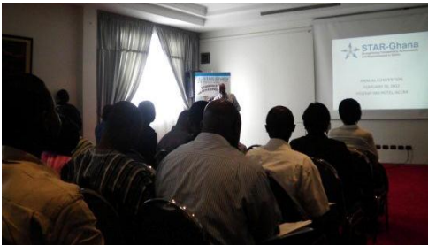
VOICE GHANA at a capacity building training for CSOs at the national level.

VOICE GHANA benefited from a number of capacity building events, organized by the Institute for Democratic Governance – IDEG that have made it possible for the organization to lead on GIFNet programmes and governance issues with local government agencies, particularly the Ho Municipal Assembly. VOICE GHANA is also a member of the Ghana National Education Campaign Coalition – GNECC, and holds the Regional Secretary post for the Volta Region Branch. GNECC is a network of over two-hundred (200) CSOs, professional bodies and individuals committed to the promotion of free, quality and enjoyable quality basic education as a fundamental human right for Ghanaian children.