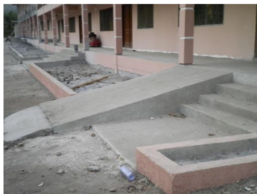
Tsito Senior High Technical (Admin. Block)

Sections 6 and 60 of the Persons with Disability Act, 2006 (Act, 715), which mandates owners and occupiers of public buildings including schools to provide easy access for persons with disabilities. VOICE GHANA has been utilizing the baseline evidence and data to engage key stakeholders in education sector in the Ho Municipality to make their schools accessible for persons with disability in view of the legislative framework. The stakeholders including Ho Municipal Assembly, Ho Municipal Education Directorate, PPMC – (Procurement and Project Management Consultancy), which is the consultant for GETFund school projects in some parts of the Volta Region, E.P Education Unit, R.C Education Unit, Anglican Education Uni, Methodist Education Unit, Salvation Army Education Unit, A.M.E. Zion Education Unit and the Ghana National Association of Private Schools in Ho.