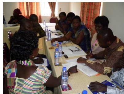
Roundtable discussion at Ho for key stakeholders in Education