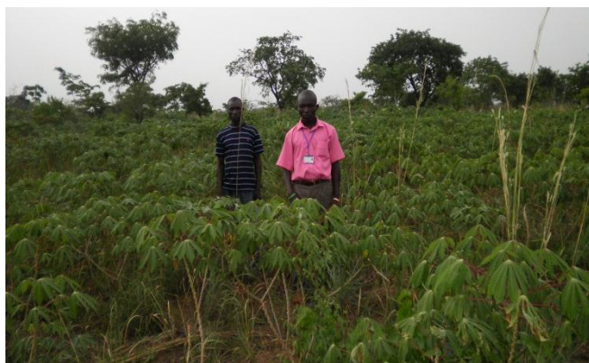
6 acres of cassava farm for Unity Disability Club, Ashiabre

VOICE GHANA is distinguished by its grassroots disability mainstreaming approach and cross disability Self-Help Group (SHG) model.